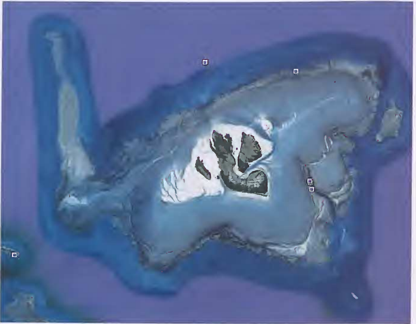
Figure 1. Montgomery Reef.

digital base map with 3 metre on ground resolution that can be further interrogated for detailed spectral information from the key "end members" including corals, algae, rhodoliths, sediments and mangroves.